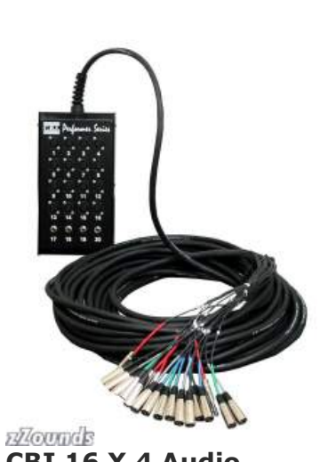
CBI 16 X 4 Audio Snake with Neutrik Connectors

gauge. Like the XLR these cables can go long distances, even to another room if required.