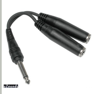
Most Dangerous Cable. TS to Dual TS. Never use this to connect 2 sources to 1 input. You can use it to split 1 output to two outputs.

Here's the standard normal procedure. Connect an insert cable in the insert jack of the mixer. The output of the Mixer goes in the bottom rear of the bay and goes out the top rear of the bay back to the Mixer. If nothing is connected to the front jacks of the patchbay, this signal will just pass through and back. To take the output of the channel from the front of the bay, you insert a cable in the bottom front jack. To patch another signal into the mixer to replace the existing signal, you patch a cable into the upper front jack.