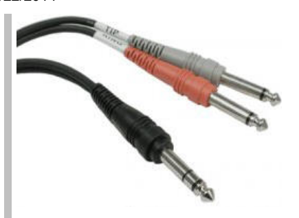
Keep them as short as possible.